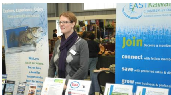
Chamber display at the Apsley Winter Carnival.