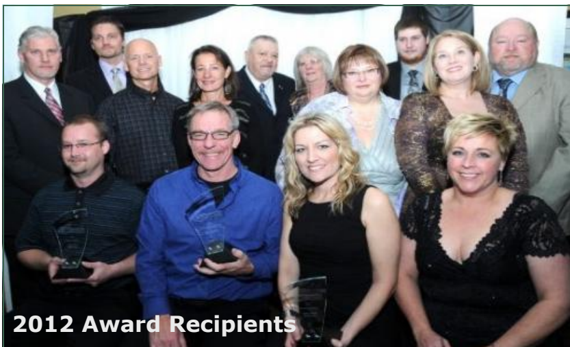
2012 Award Recipients